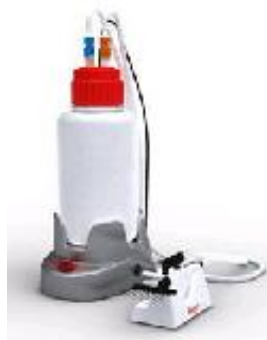
Precision Aspiration System