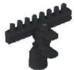
for single tips