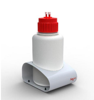
2litre bottle holder