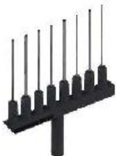
for deep well aspiration